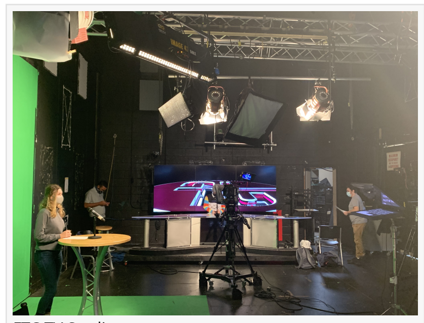
FTC TV Studio

Every year, the Intercollegiate Broadcast System (IBS) is proud to honor the best and the brightest among college and high school media. Five Towns College Mass