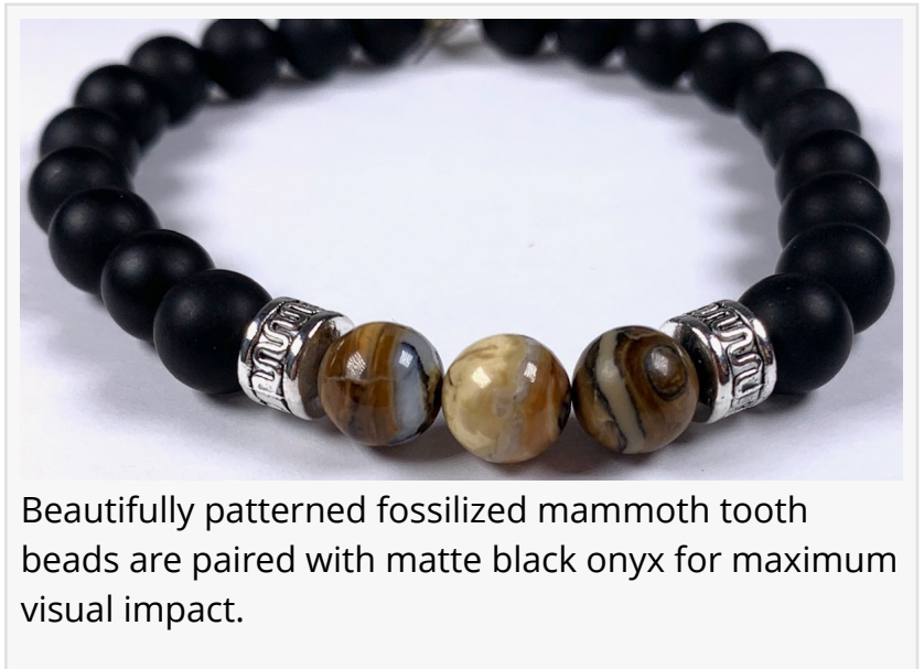
Beautifully patterned fossilized mammoth tooth beads are paired with matte black onyx for maximum visual impact.