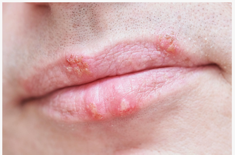
Typical cold sore infection caused by Herpes simplex virus

ST PAUL, MINNESOTA, USA, January 19, 2021 /EINPresswire.com/ -- Squarex Pharma (SQX), a St. Paul, Minnesota, USA-based company, announced updated results from its Phase 2 clinical study on humans with its novel asset SQX770 for prevention of cold sores, also known as herpes labialis or oral herpes, an illness caused by herpes simplex virus, usually type 1 (HSV-1).