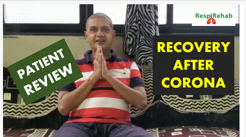
Recovery post Covid 19 with RespiRehab Pulmonary Rehab program by ReLiva Physiotherapy

MUMBAI, MAHARASHTRA, INDIA, January 19, 2021 /EINPresswire.com/ -- For many COVID-19 patients, the battle to breathe well continues well after the discharge from hospital. Many of the patients who develop moderate to severe symptoms of COVID-19 will require rehabilitation after they are discharged or risk developing chronic lung issues that can significantly impair their quality of life and ability to return to work.