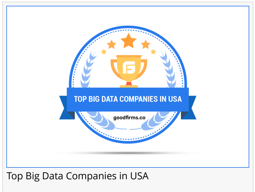
Top Big Data Companies in USA

WASHINGTON DC, WASHINGTON, UNITED STATES, January 19, 2021 /EINPresswire.com/ -- Today, the business world is becoming more competitive, which has created a demand for the right tools to keep up with the latest trends and stay ahead in the race. Various industries are currently implementing big data tools to help them build winning business models and gain valuable insights for better decisions making.