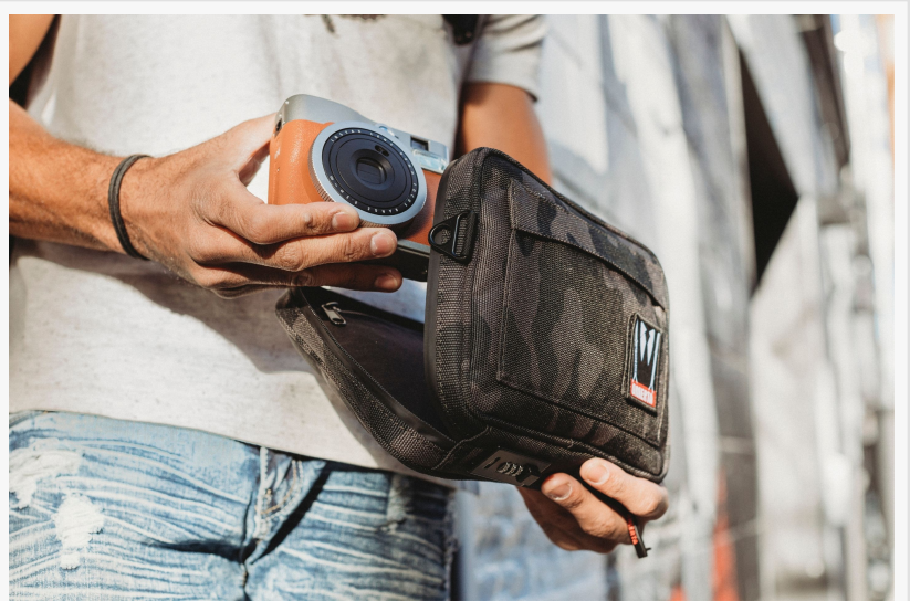
Dime Bags Omerta The Boss with Lock Smell Proof Pouch

About Dime Bags: Dime Bags is recognized in the hearts of hemp fans around the globe for our innovative solutions to the modern smoker's needs which include superior glass protection, carbon-filter smell proof technology, and a full line of handbags, backpacks, and accessories made with hemp. Dime Bags isn't just for the smoker community anymore though, with stylish lifestyle bags made from eco-friendly methods and elements, anybody can feel great about owning a Dime Bag. A variety of Dime Bags have been featured in the media, from FXX's Dave to HBO's Silicon Valley. To learn more about Dime Bags, visit DimeBags.com or call 1-888-520-8808.