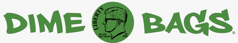
Dime Bags Logo | Dime Bags