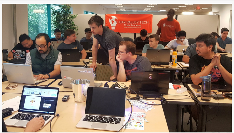
Bay Valley Tech Code Academy

Companies and other parties interested in sponsoring Bay Valley Tech's many developer events or providing code academy scholarships for students in need should contact: martyn@bayvalleytech.com .