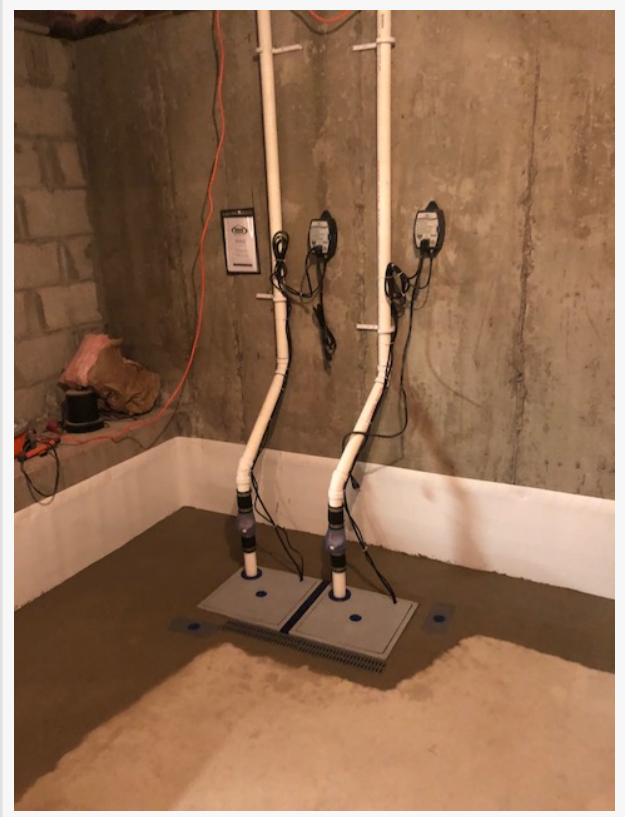
AFTER- Basement Waterproofing Services RI

Prior to the cold-weather arrival, one way to prevent problems is by scheduling a waterproofing service. The experts will start with a thorough and complimentary evaluation of the structure's foundation, ensuring no detail is overlooked. With their highly-trained eyes, they can detect even the tiniest foundation crack where water is getting in. What may seem insignificant now can expand and contract with the changing weather and create the