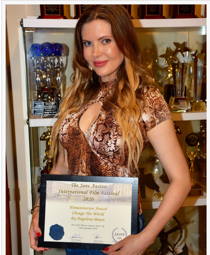
Humanitarian Award Recipient - The Jane Austen International Film Festival