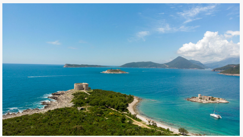
Montenegro's stunning coast line

This coastline is also drenched in history, with UNESCO World Heritage listed medieval fortifications and atmospheric churches and palazzi that guests can discover under their own steam or as part of one of Dm Yachting Cruises' intimate guided tours.