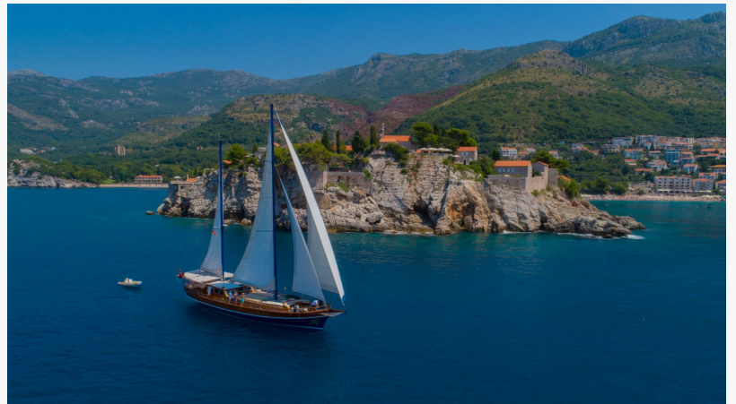
Gulet with hoisted sails passing by famous Sveti Stefan on Montenegro's coast