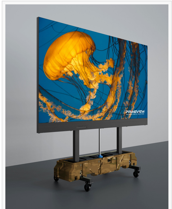
PRVFSNM2GOR Camo (Tan)