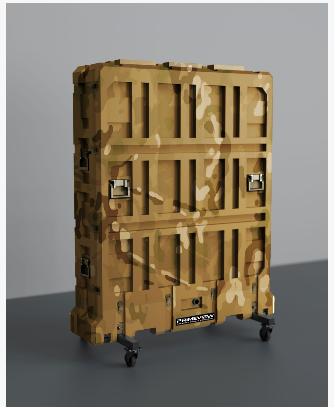
PRVFSNM2GOR Camo (Tan)