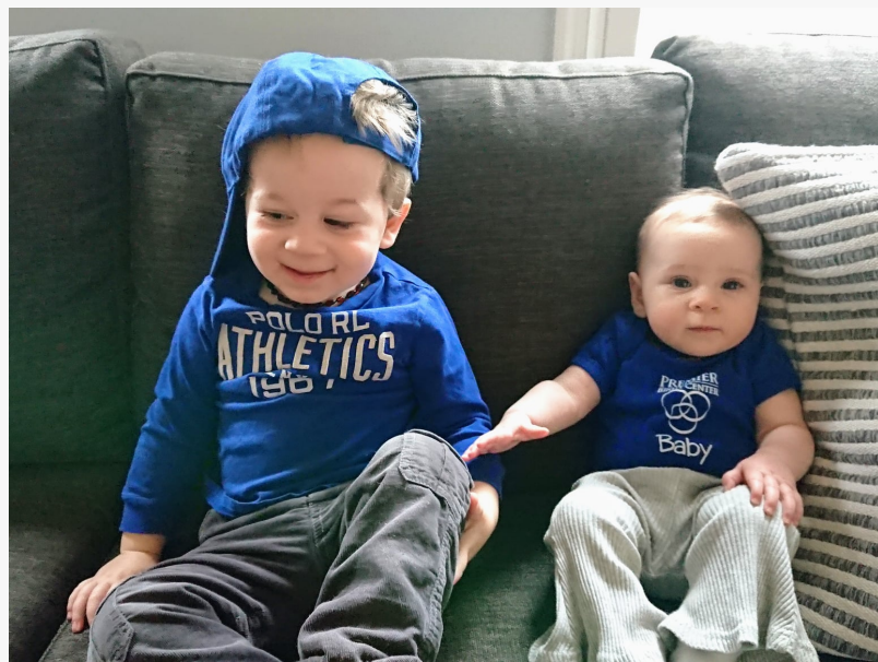
Even the very young joined in the awareness campaign!