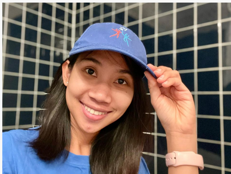
Youth volunteer promoting human trafficking awareness day