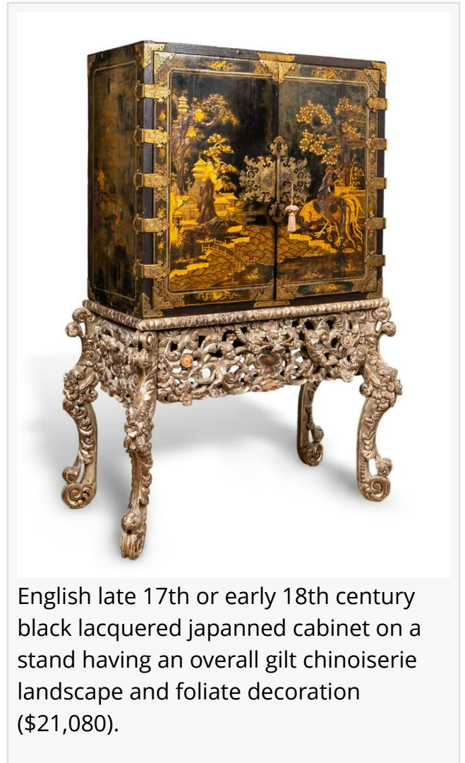
English late 17th or early 18th century black lacquered japanned cabinet on a stand having an overall gilt chinoiserie landscape and foliate decoration ($21,080).

Ahlers & Ogletree is a multi-faceted, family-owned business that spans the antiques, estate sale, wholesale, liquidation, auction and related industries. Ahlers & Ogletree is always seeking quality consignments for future auctions. To consign an item, an estate or a collection, you may call them at 404-869-2478; or, you can send them an e-mail, at consign@AandOAuctions.com .