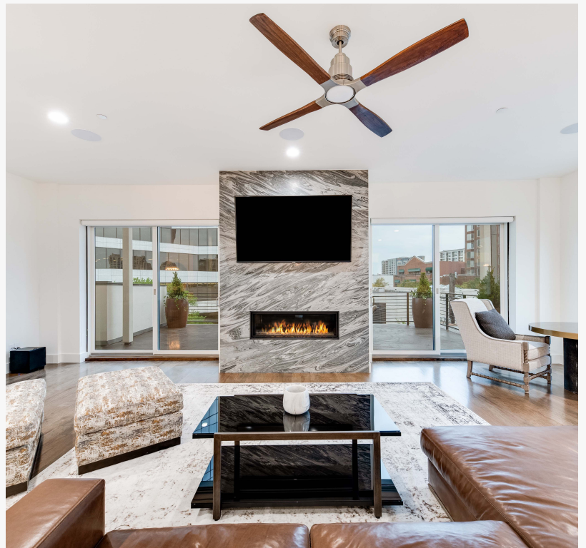
The four-story penthouse has the feel of a stand-alone home.