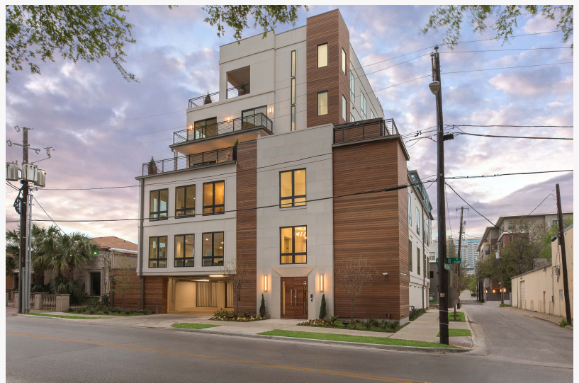
Live and work in modern luxury in the heart of Uptown, minutes from Downtown Dallas.