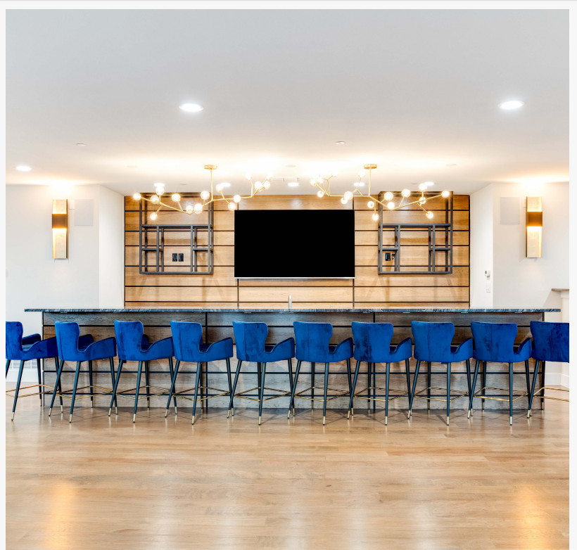
This six-story turnkey/furnished property offers a desirable blend of commercial and residential possibilities.

About Concierge Auctions Concierge Auctions is the world’s largest luxury real estate auction firm with a state-of-the-art digital marketing, property preview, and bidding platform. The firm matches sellers of one-of-a-kind properties with the most high-net-worth property connoisseurs on the planet. Sellers gain unmatched reach,