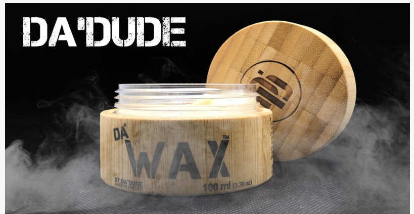
Da'Wax Unique Wooden Tub

This press release can be viewed online at: https://www.einpresswire.com/article/534989783