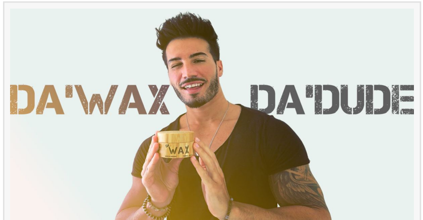
Da'Wax Hair Styling Wax