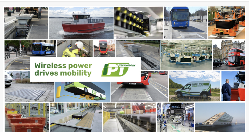
IPT Wireless power drives mobility

"We will finalise and complete the developments of PRIMOVE's Z-Move and implement the first pilot in Barcelona at the end of 2021," says IPT Management. Early 2021 IPT will also participate