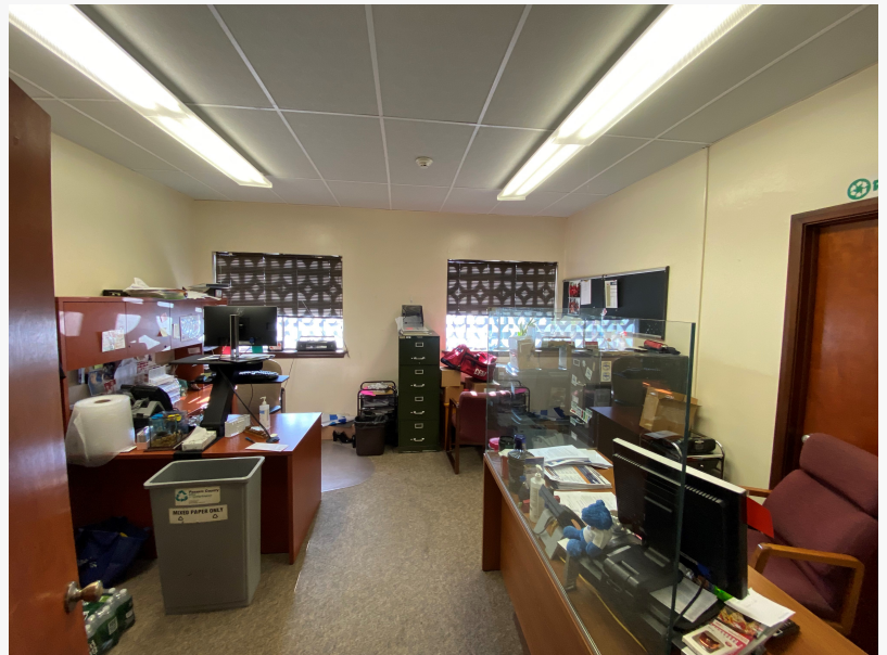
7,308+/- SF Office Building

This press release can be viewed online at: https://www.einpresswire.com/article/535059257 EIN Presswire's priority is source transparency. We do not allow opaque clients, and our editors try to be careful about weeding out false and misleading content. As a user, if you see something we have missed, please do bring it to our attention. Your help is welcome. EIN Presswire, Everyone's Internet News Presswire™, tries to define some of the boundaries that are reasonable in today's world. Please see our Editorial Guidelines for more information. © 1995-2021 IPD Group, Inc. All Right Reserved.