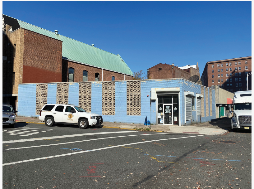
18-20 Clark St, Paterson

PATERSON, NEW JERSEY, USA, January 25, 2021 /EINPresswire.com/ -- Max Spann Real Estate & Auction Co is pleased to announce the Auction of the former Passaic County Department of Health Building located at 18-20 Clark Street in Paterson , New Jersey. The 7,308+/- sq. ft. building will be sold by order of Passaic County in an online only Auction concluding Thursday, February 18, 2021 at 11:00AM. Bidders may bid on their computer or through the Max Spann phone app.