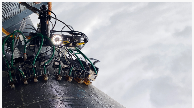
Our TOKA robots are designed to crawl hard-to-reach assets, such as overhead piping.