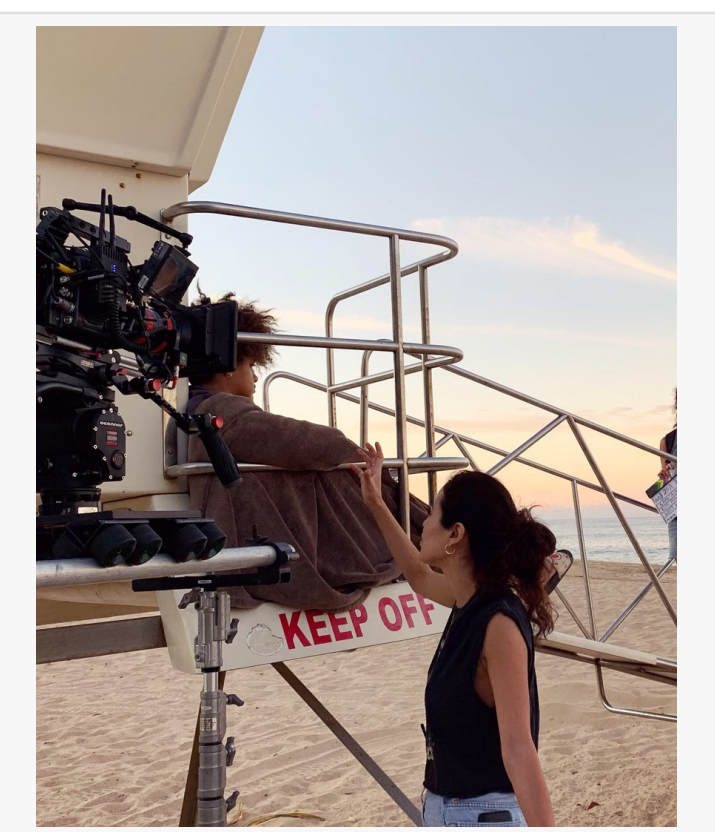
Behind the Scenes of Kama Dāina