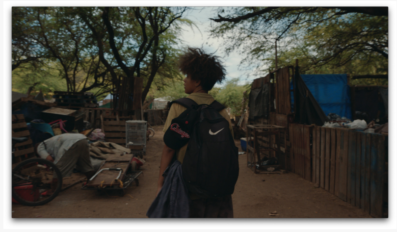
Still of Kama🛛āina Film

This press release can be viewed online at: https://www.einpresswire.com/article/535079264