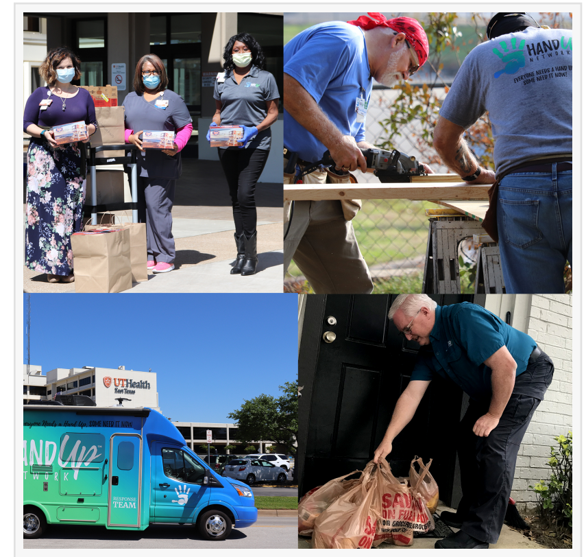
Individuals, Elderly, Respite Care, First Responder, and Medical Professional Support

The Mentoring Program continues to grow and we are seeing substantial documented success for our Clients that continue to work hard to achieve the life they desire. These journeys are not short-term, but a methodical process to ensure a firm foundation in which to grow and achieve lasting success in the community. Once this foundation has been established, our Clients that are now entering Tier 2