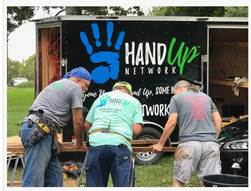
Hand Up Network Response Teams respond to the needs of East Texans.

support are seeing great success in life and we are thrilled to continue to be their Support System as they achieve the success they earned!