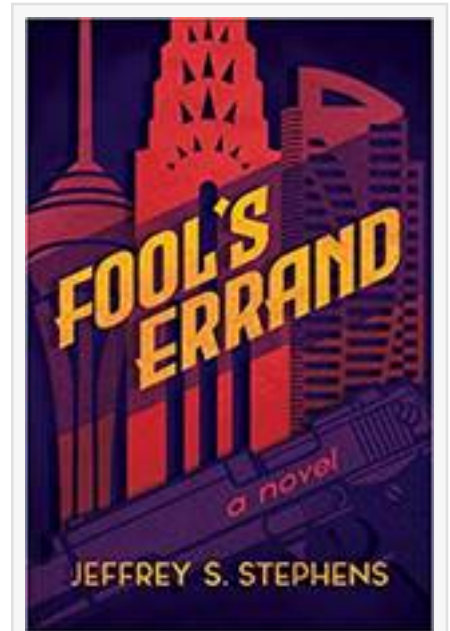
Fool's Errand by Jeffrey S. Stephens

This press release can be viewed online at: https://www.einpresswire.com/article/535092423