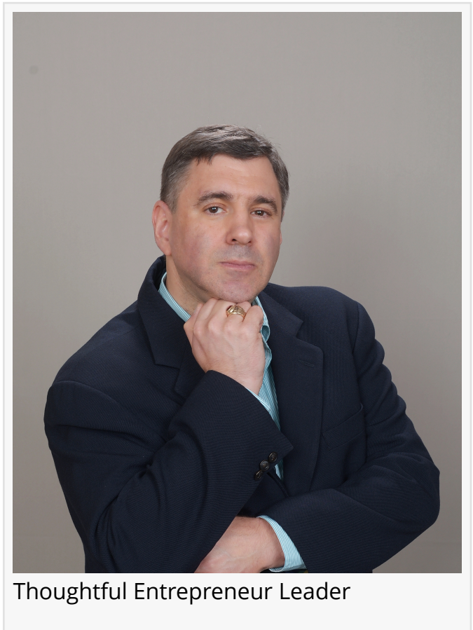
Thoughtful Entrepreneur Leader