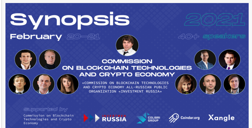
Commission on Blockchain Technologies and Crypto Economy of Russia and the Russian-wide public organization Investment Russia