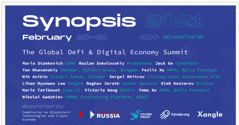
Speakers Synopsis 2021

Synopsis 2021 gathers over 40 speakers from 16 countries. They are members of innovative projects, digital economy evangelists, experts in DeFi, trading, market analytics, mining, NFTs, marketing and administration, regulation, state-business interactions, and related areas. As per