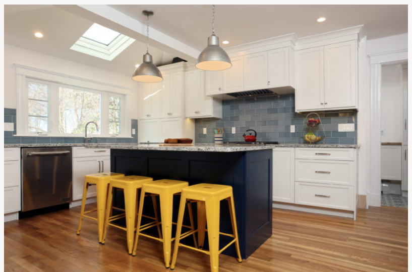
Newton Kitchen Remodel

A multi-ethnic, young, talented team of creatives with diverse backgrounds stand proudly at the core of NEDC's design team--many whose families immigrated to New England over the past few generations from a varied array of cultural backgrounds. These creative artists and artisans have since risen through some of Boston and New England's top design universities and Architectural schools--they are now remaking environmental awareness