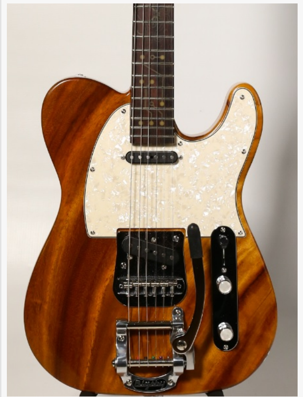
JoinWith.Me, special guitar built by Vigilant Guitars (Trevor Woodland)

This press release can be viewed online at: https://www.einpresswire.com/article/535095438