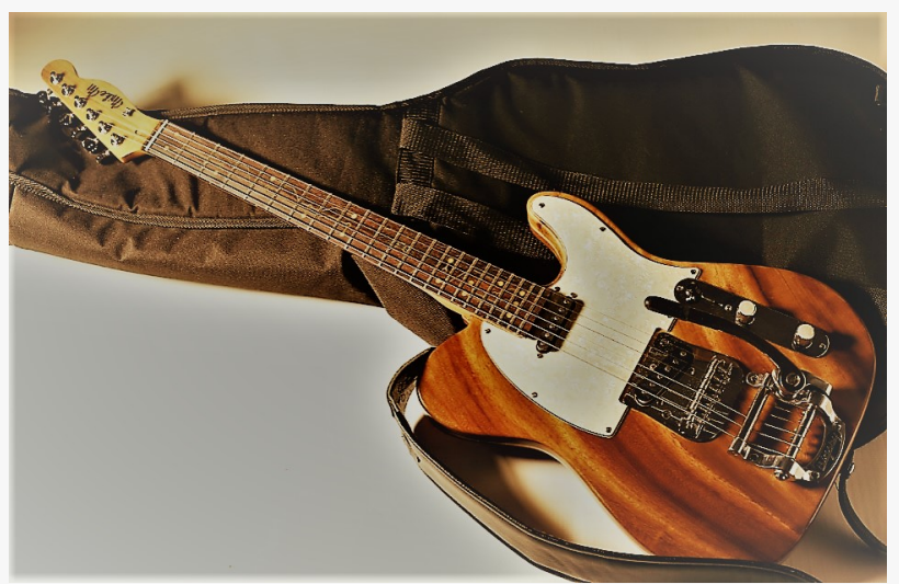
JoinWith.Me guitar, special built by Vigilant Guitars (Trevor Woodland)