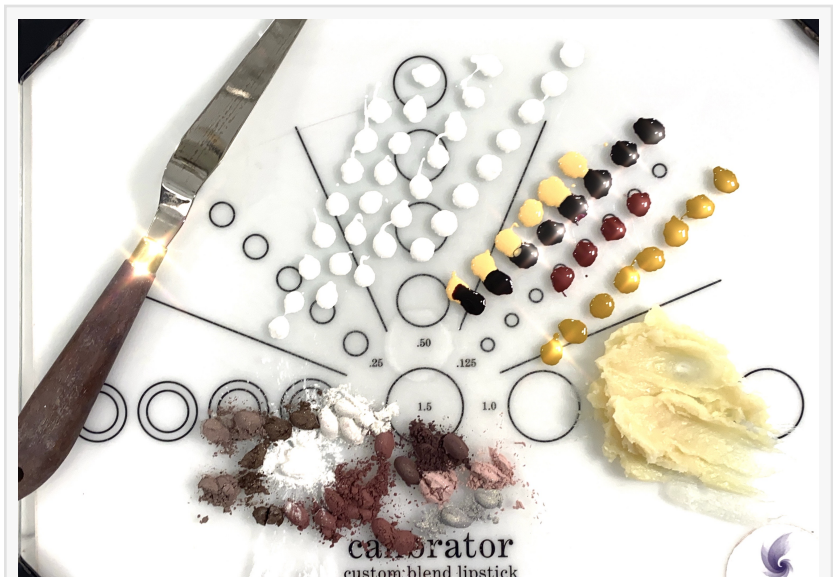
Vegan custom lipstick pigments on blending board