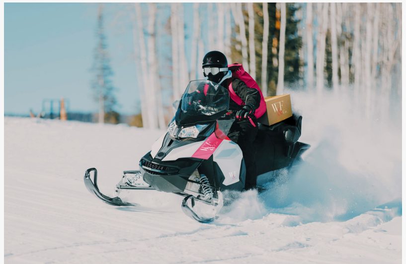
Pre-owned watch specialist Watchfinder & Co. launch new home collection service.