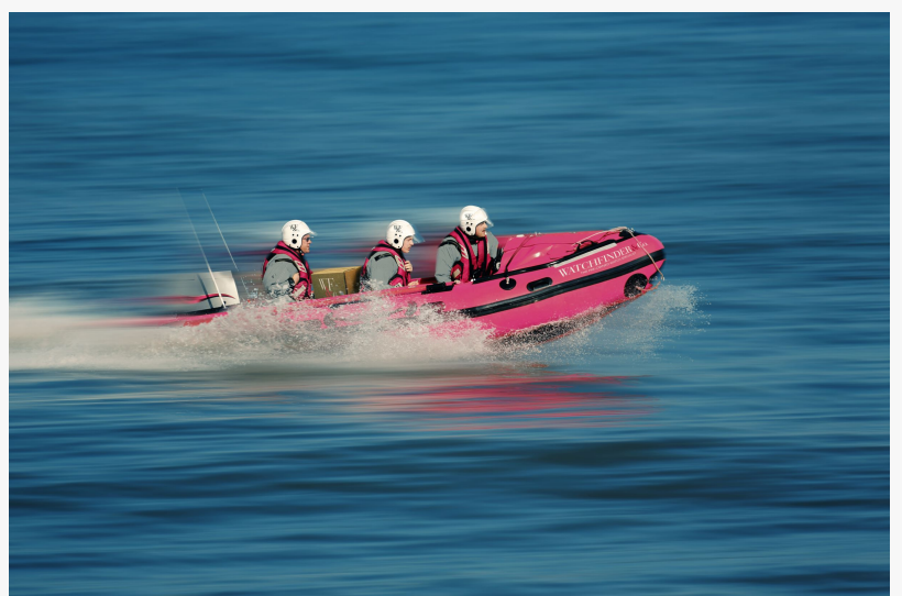
Pre-owned watch specialist Watchfinder & Co. launch new home collection service.

Founded in 2002 Watchfinder & Co. is the premier resource from which to buy, sell and part-exchange pre-owned luxury watches. From bestsellers, through to vintage and limited edition pieces, Watchfinder offers over 4,000 watches from more than 70 luxury brands, all available online and via their network of boutiques and showrooms. With quality and dependability at the heart of their business; all watches are meticulously inspected, authenticated and prepared by a team of expert watchmakers in Europe's largest independent service centre - accredited by 19 of the world's leading watch manufacturers. Every watch also comes with a 24-month Watchfinder warranty. For 18 years Watchfinder has delivered knowledge and service that meets the very highest standards, and their customer testimonials stand testament to that with over 20,000 5