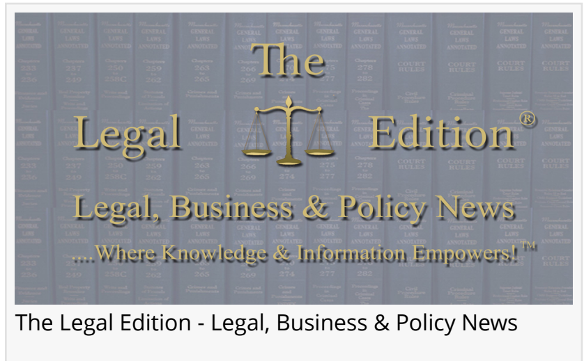
The Legal Edition - Legal, Business & Policy News

BOSTON, MASSACHUSETTS, UNITED STATES, January 28, 2021 /EINPresswire.com/ -- The Legal Edition - Legal, Business & Policy News award-winning TV programming , and its 'In-the-News' articles & publications has added Podcasts to its program lineup. Embarking on its ninth year in broadcasts, the discussion format provides viewers with thought-provoking insights, on high-profile issues.