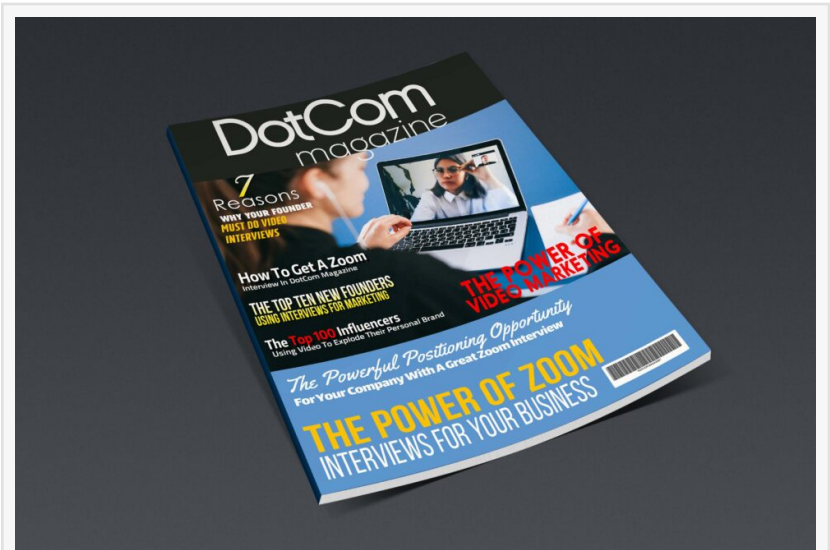
DotCom Magazine "The Zoom Interview Issue"

Further Information: http://www.DotComMagazine.com