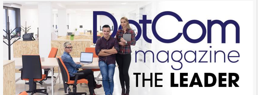
The DotCom Magazine Entrepreneur Spotlight Series