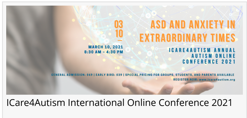
ICare4Autism International Online Conference 2021

ICare4Autism hopes to reach its widest audience yet by hosting the conference online for the