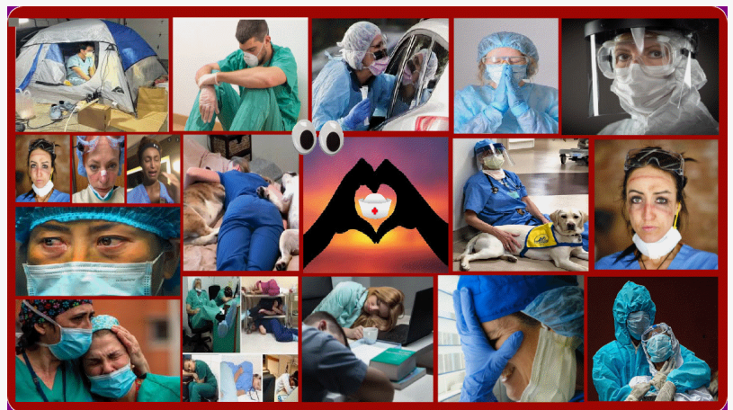
Nurses: Covid-19's frontline unsung heroes ...

That's the 2021 mission objective of Operation Scrubs -- one billion+ people saying "thank you" to the world's 27+ million frontline unsung hero nurses.