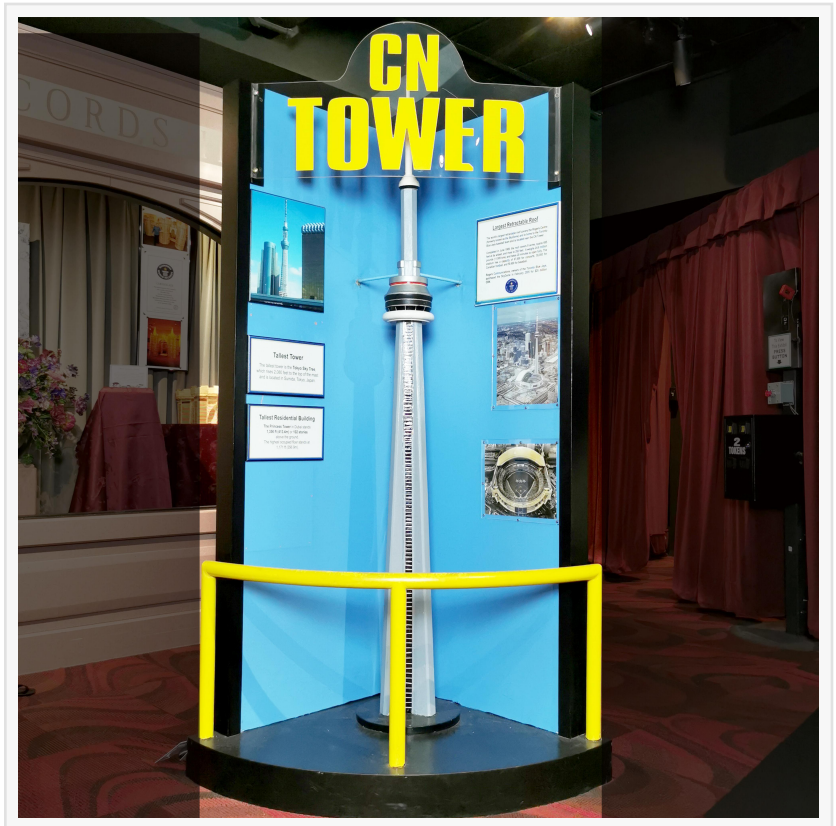
Wooden CN Tower model, with a record card (for "Tallest Towers") and many other record cards for Skydome, space flight and astronauts (est. $300-$500).

Kristen Hein Ripley Auctions +1 317-251-5635 email us here