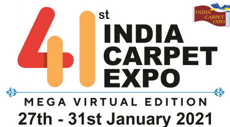
41st India Carpet Expo - Mega Virtual Edition

DELHI, INDIA, January 29, 2021 /EINPresswire.com/ -- After the excitement of 72nd Republic Day, India is all set to delve into the virtual festivities of the 41st India Carpet Expo . 2021 virtual edition of the long running tradition of exhibiting the rich cultural essence of the handmade Indian Carpets and Rugs for an international audience. This event is managed & organized by the Carpet Export Promotion Council.