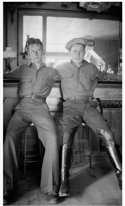
Photograph by Lora Webb Nichols of two Civilian Conservation Corps Workers at the Sugar Bowl Soda Foundation, Encampment, Wyoming, 1933

This press release can be viewed online at: https://www.einpresswire.com/article/535142353