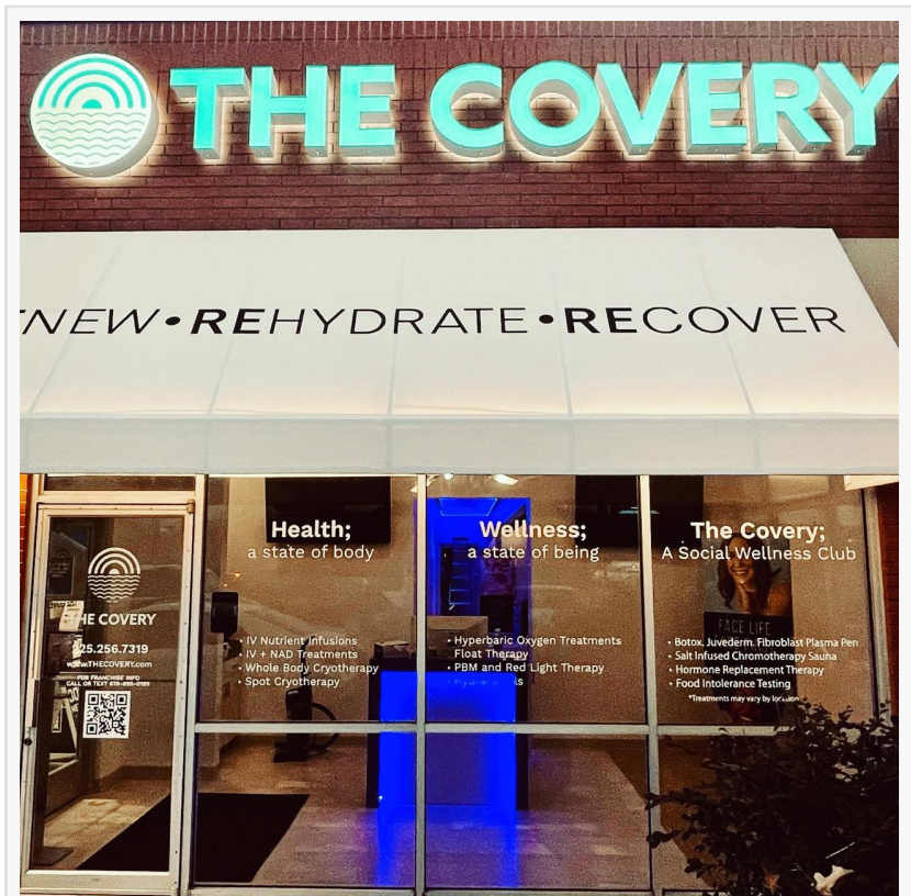
The COVERY in Baton Rouge, LA

CryoBuilt Address; 1534 N. Market Blvd. Sacramento, CA 95834 1-800-633-1400