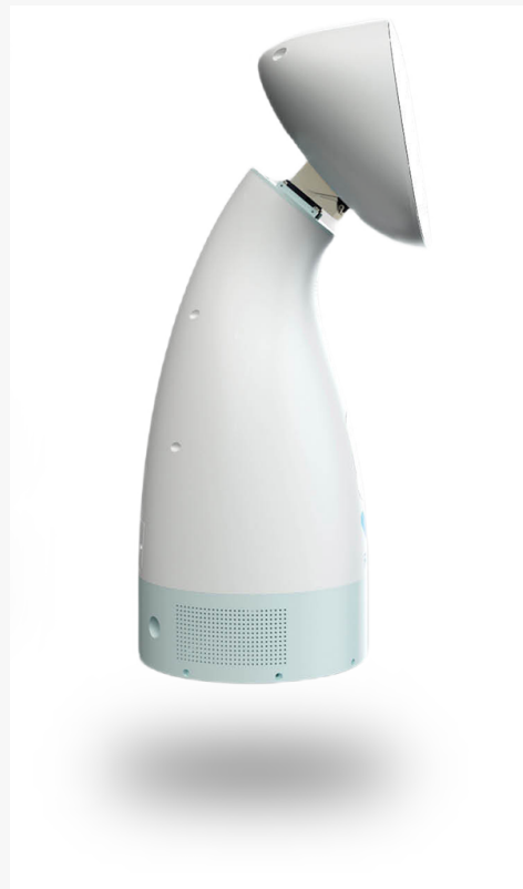
Fari Robot - Healthcare and Elderly Care Companion