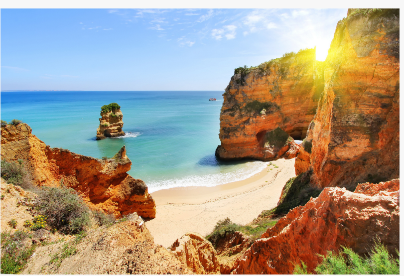
One of the many golden beaches in the Algarve, Portugal!