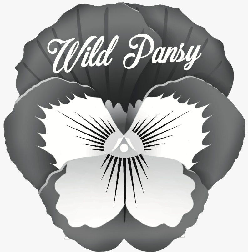
Wild Pansy logo