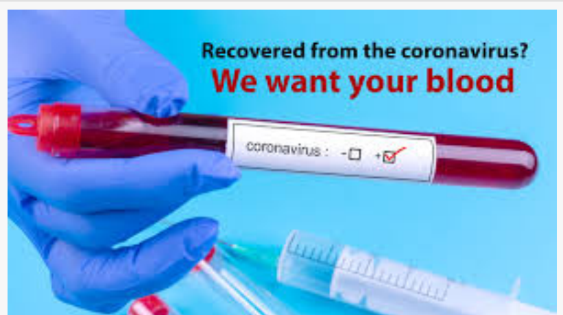
COVID 19 Recovered Plasma Donors

Sprint Data Solutions Worldwide Marketing began life as the idea of a disabled veteran. Having honorably served the country by defending it, the next goal after that was to help bolster what had just been protected. The decision was made to assist the businesses of America to grow.