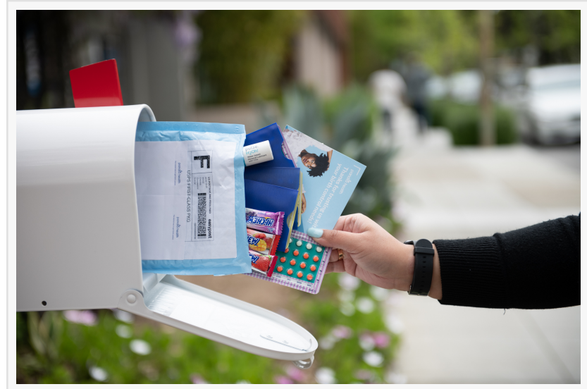
Pandia Health birth control comes right to your mailbox.

□□are from birth control expert physicians who understand and advocate for women's reproductive/sexual health concerns. □□onvenient, reliable, and confidential asynchronous telehealth for only $20 once a year to obtain an appropriate prescription, wherever you have Internet and a mailbox. No need to wait in line.