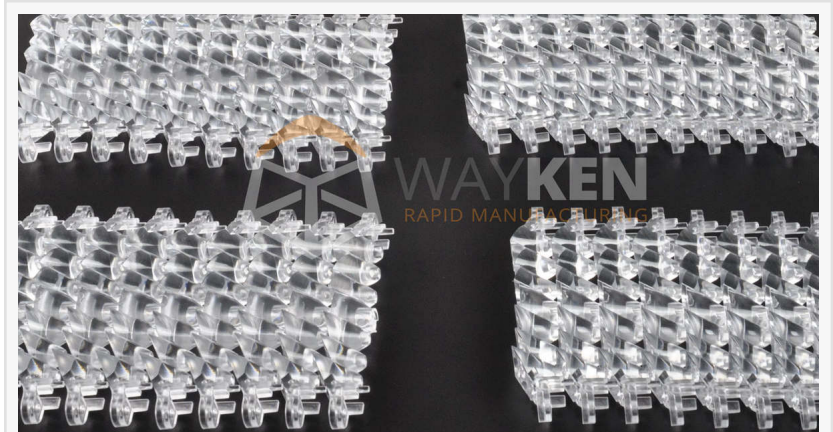
low volume production-feature image

show cars comprise components that stem from prototype models, trial production parts, and production car versions. Hence, the company strongly commits to interacting with consumers, providing them with assessments during special auto events, including trade shows.