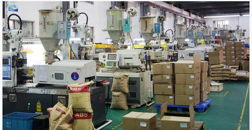
low volume production-3