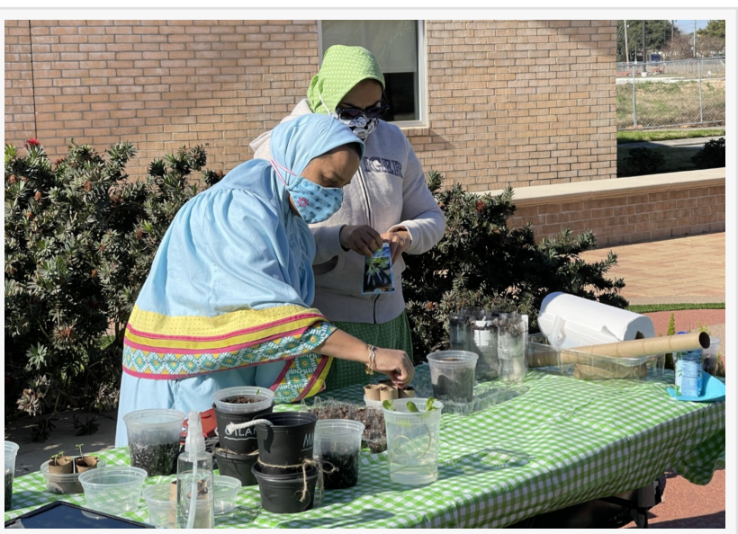
Houston Bohra Moms Teach Daughters to Grow Herbs in Recycled Plastic

Local Bohra "Supermoms" are teaching their daughters to think of creative