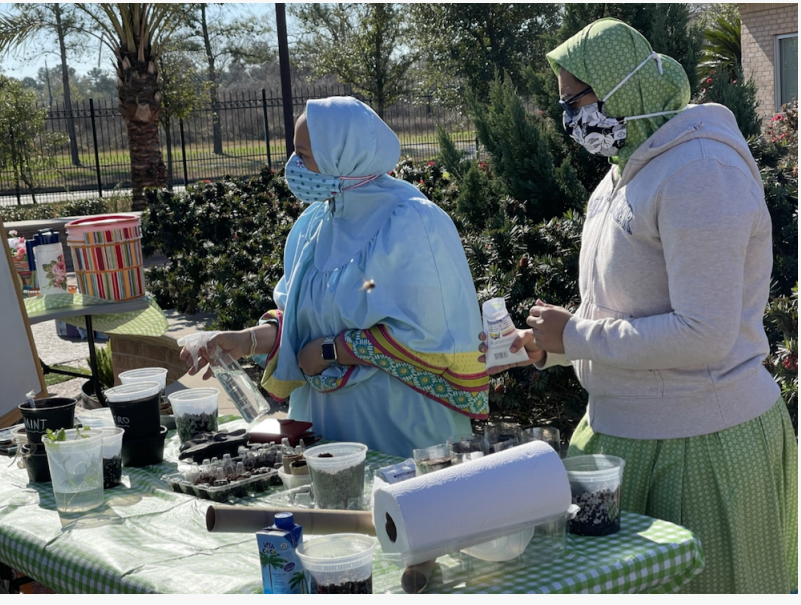
Bohra Women of Houston launch the Happy Nests initiative.