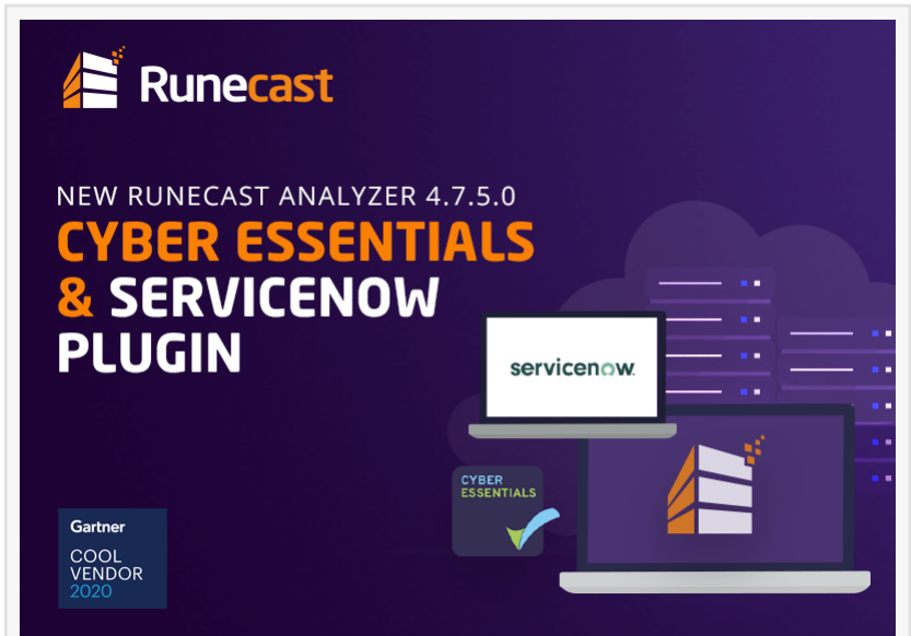
Runecast adds ServiceNow plugin & U.K. Cyber Essentials audits