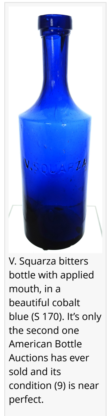
V. Squarza bitters bottle with applied mouth, in a beautiful cobalt blue (S 170). It's only the second one American Bottle Auctions has ever sold and its condition (9) is near perfect.

The bottles Don accumulated often came in different variants, applied top or tooled top of the same bottle, color runs and at the top of his list were squares. Included in the auction is his run of Renz's Bitters and Rosenbaum's. From the very rare and valuable to the grouping of Lash's Bitters in every shape and size, Don knew what a collector had to do to collect every specimen. His desire to collect sodas and mineral waters was a valiant one. Where most Western collectors go after examples made in San Francisco, Don had a varying number of pontiled bottles that were made in the East and sent out West for a Western company. Once again, color runs were an exciting part of his soda collection, as he has different colored examples of the same bottle. Don will still maintain his vast collection of Marysville bottles. His home is located in the forest, and with the fires that have occurred in recent years, he won't miss what seemed a yearly evacuation to save his bottle collection. He looks forward to taking it easy and doing some