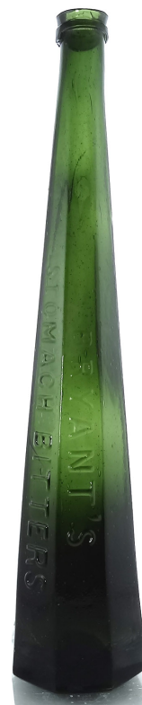
Bryant's Stomach Bitters (Cone) with applied top and sticky pontil mark. The Bryant's Cone might be the most iconic Western bottle out there. There are maybe 10 known in any condition.

This press release can be viewed online at: https://www.einpresswire.com/article/535217669