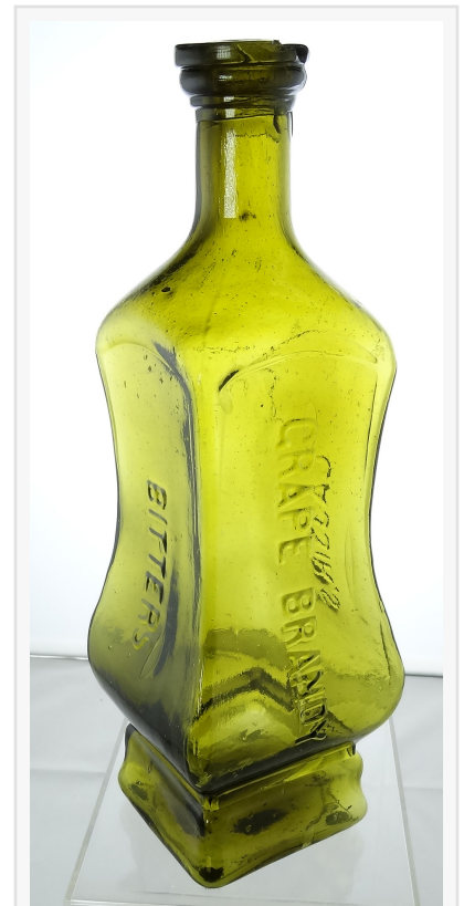
Cassin's Grape Brandy Bitters, circa 1866-1873 (C 78). This is a second variant example in a beautiful yellow-green color. It has an imperfectly formed top, but still grades well at 8.5.