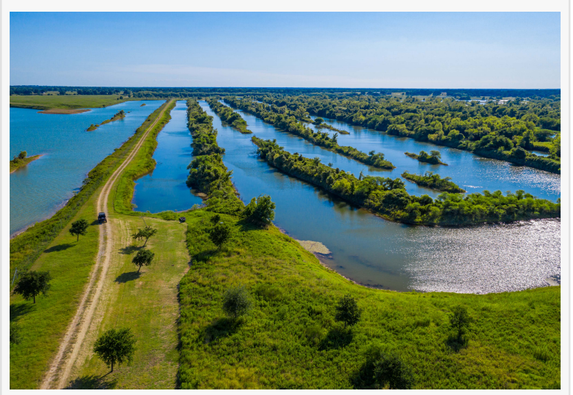
Fish and duck hunt along 192 acres of finger lakes