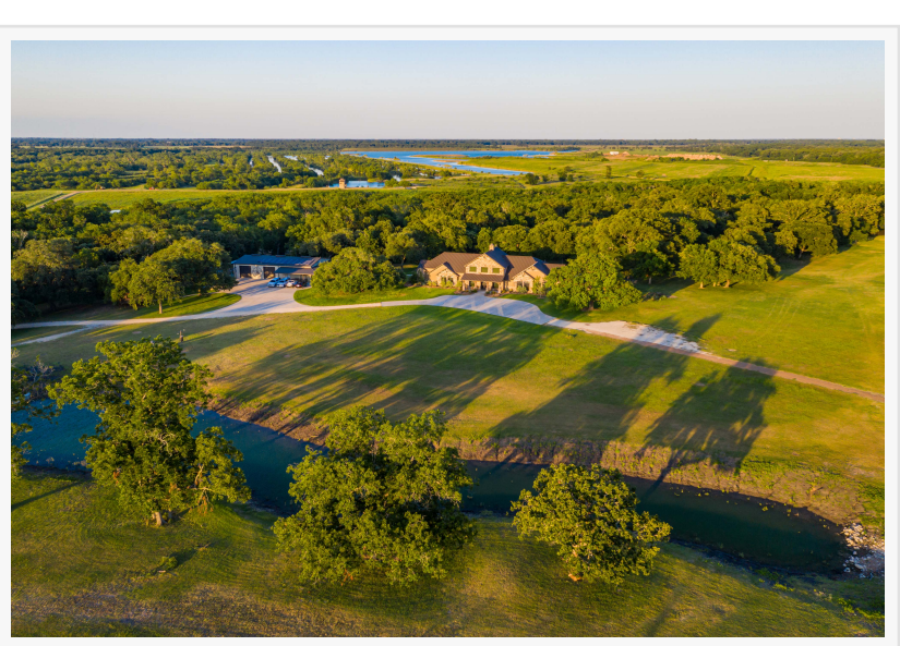
Quality and craftsmanship create this one-of-a-kind ranch

Previously offered for $9.9 million, the property sold during the auction process on January 28.