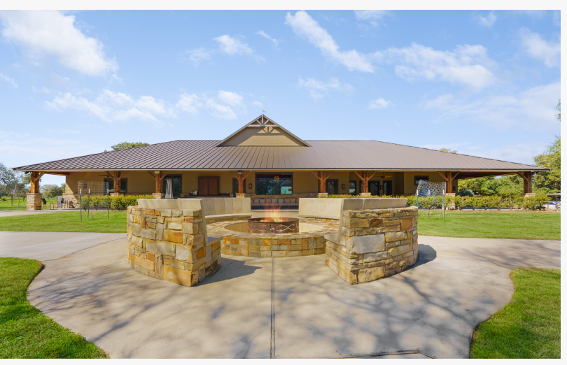
Outdoor entertaining area with BBQ and stone fire pit