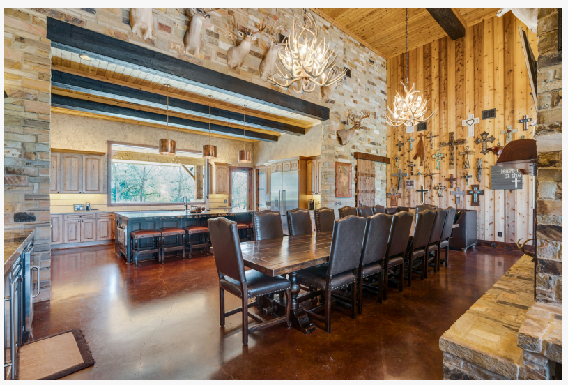
Host in luxury with a chef's kitchen, ideal for gatherings

About Concierge Auctions Concierge Auctions is the world's largest luxury real estate auction firm with a state-of-the-art digital marketing, property preview, and