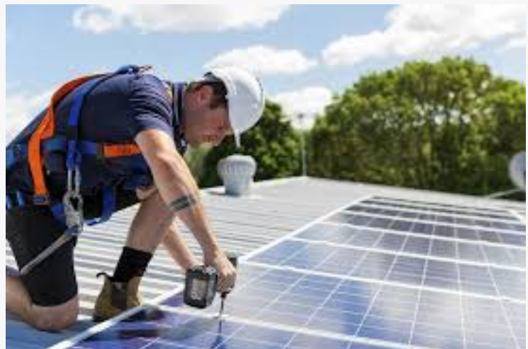
Solar Powered Homeowners