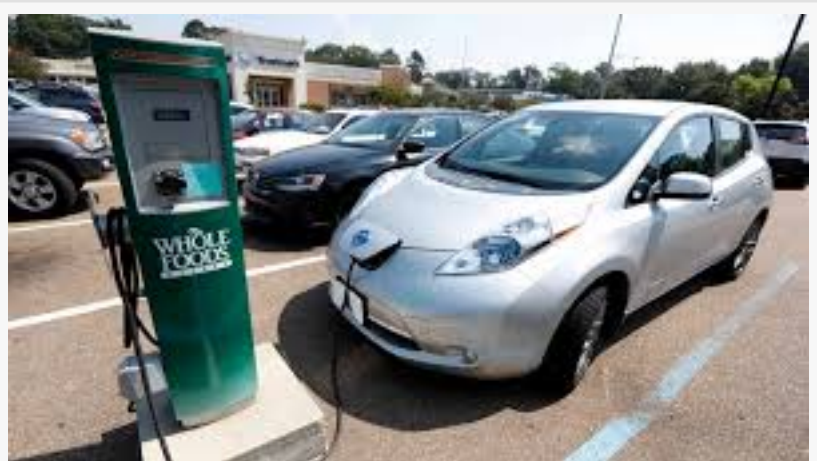
Electric Cars & Solar Homeowners

We have the contact information for homeowners with electric vehicles that you need. Now, it is