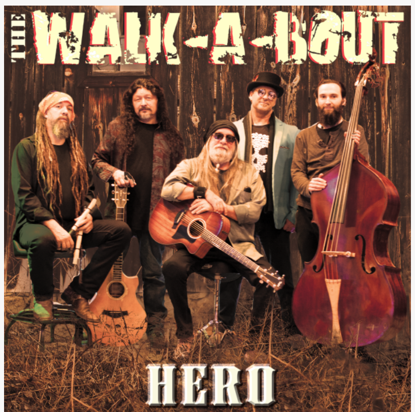
The Walk-A-Bout - "Hero"

THE WALK-A-BOUT began writing the material for 20/20 in March of 2019, right at the time when the band began to achieve massive radio success with their album Things Are Looking Up, which