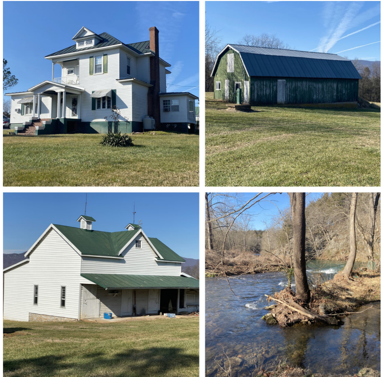
1581 Rt. 340 North, Luray, VA

Other 'Mont-View' noteworthy attributes include: