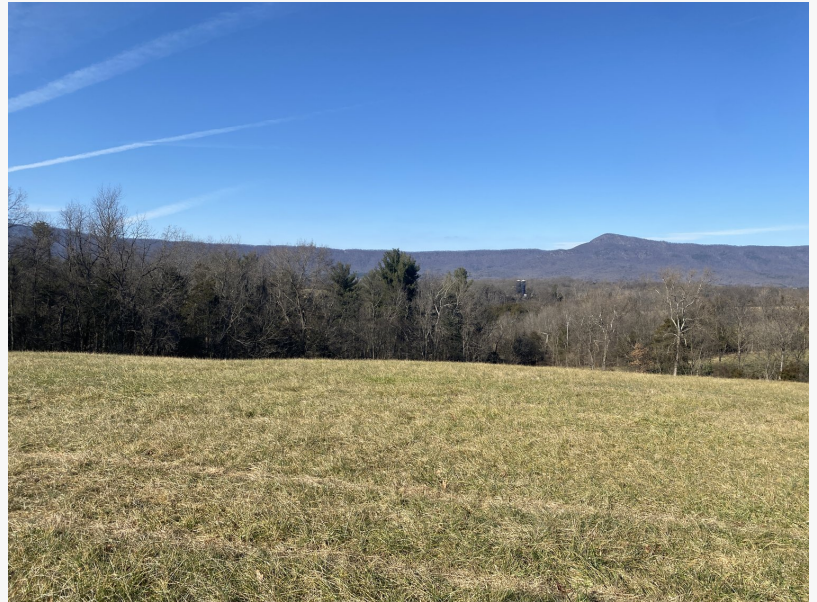
1581 Rt. 340 North, Luray, VA