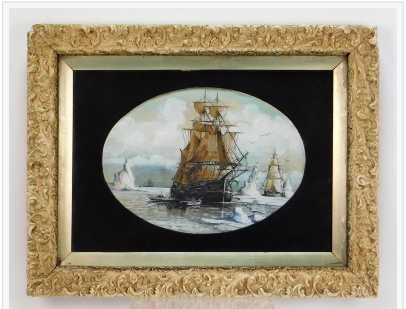
Original gouache on paper Arctic marine painting by William Bradford (Mass./Calif., 1823-1892), depicting three large sailing vessels between icebergs and frozen waters ($4,375).