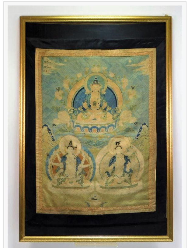
Chinese Qing Dynasty (1644-1912) or earlier embroidered tapestry depicting three Buddha figures seated on lotus thrones, nicely housed in a 37 ¾ inch by 25 ½ inch frame ($12,500).

A group of more than 50 items relating to fly fishing – including slides, books, a belt buckle and