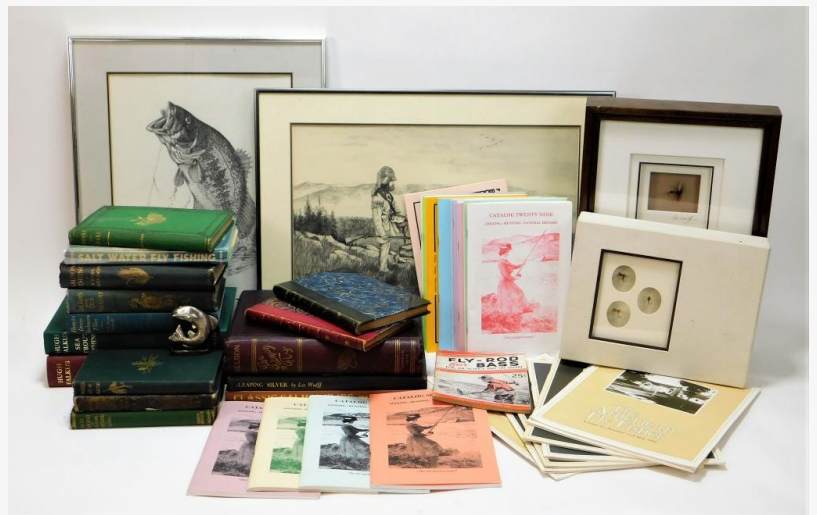
Impressive group of more than 50 items relating to fly fishing – including slides, books, a belt buckle and other ephemera, plus a fish drawing signed by artist John Noga ($4,688).