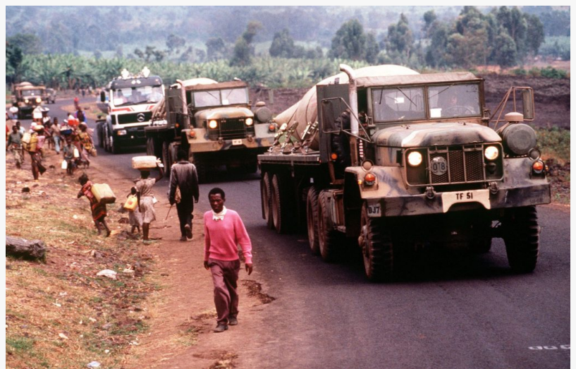
Rwanda Ethnic Conflict and Genocide